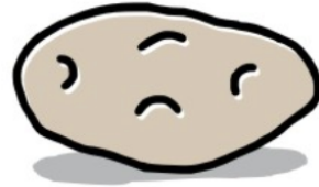
potato (not a rock)